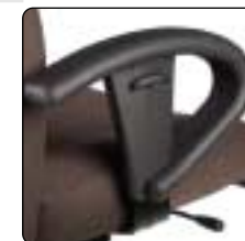
Standard "9S" boomerang shaped arms – height adjustable arm in soft touch, durable self-skinned urethane