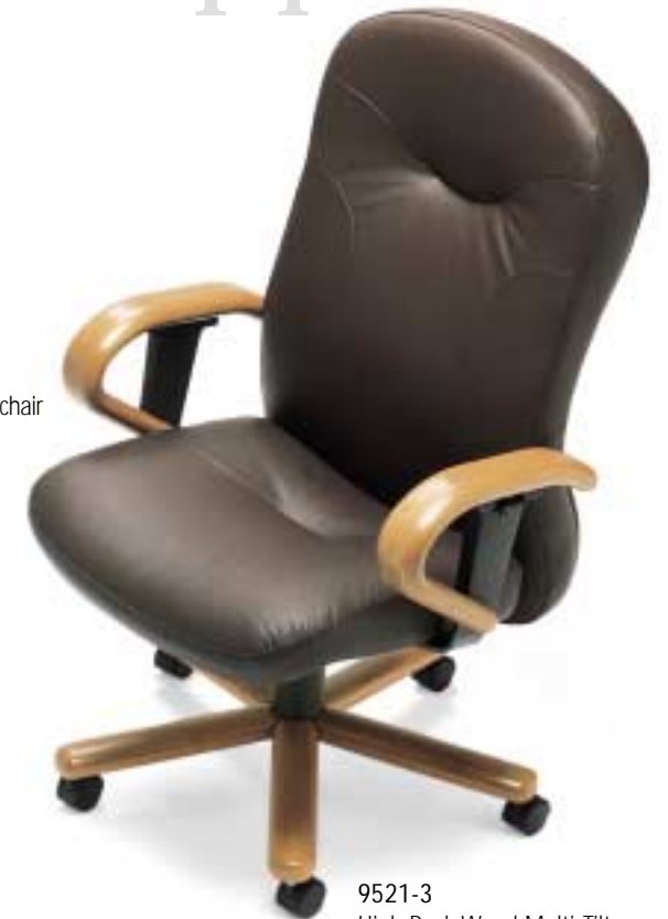
9521-3 High Back Wood Multi-Tilter

The back angle can be adjusted on most models to support the user comfortably while keyboarding, conferencing or relaxing. All arms provide height adjustment, while arm width adjustment is optional. Seats are compound curved with contoured cushions and a waterfall front edge for extended user comfort and support.