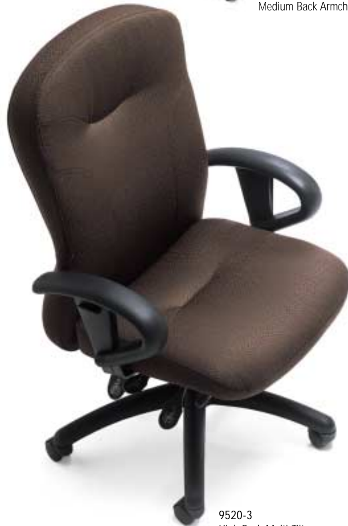
9520-3 High Back Multi-Tilter

Multiple models offer the consumer the right chair for every application. Back height is adjustable to allow the user to properly position the built-in lumbar support for optimum comfort.