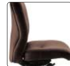
Deeply contoured cushions – shaped foam ensures exact comfort every time and provides additional durability and support