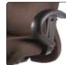
Concealed Lumbar height adjustment – operates by lifting the back to the users preferred position