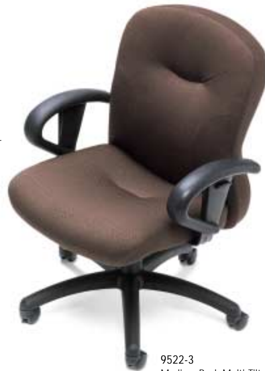
9522-3 Medium Back Multi-Tilter

The back angle can be adjusted on most models to support the user comfortably while keyboarding, conferencing or relaxing. All arms provide height adjustment, while arm width adjustment is optional. Seats are compound curved with contoured cushions and a waterfall front edge for extended user comfort and support.