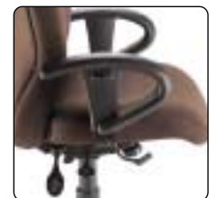
Optional seat slider – available to allow the chair depth to be adjusted to fit the body. (Available on Multi-tilter and Synchro-tilter models only)