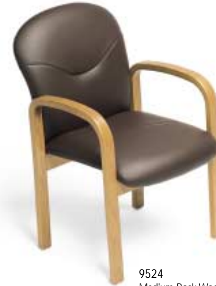
9524 Medium Back Wood Armchair