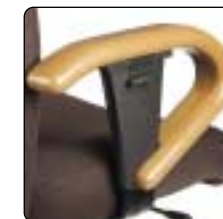
Option "9B" boomerang arm – height adjustable and offered in all standard wood finishes