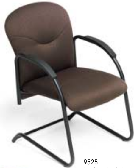
9525 Medium Back Armchair