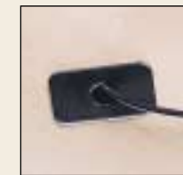
Work Surface grommet / wire pass through