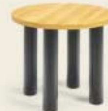
Mono Post Base - shown with a round top