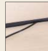
Hutch - Soft wire way for cable management at bottom