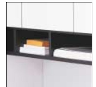
Pigeon Hole Storage

Whether a workplace calls for individual use, teaming or hotelling, Adaptabilities offers the range of mix and match modular components, in a choice of 169 standard color combinations - from rich traditional mahogany to contemporary solids. Progressively designed and functional bow front desks are complemented by attractive cabinetry and credenza options.