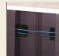
5 Sided & Extended Corner, Support Leg with wire pass through