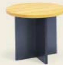
Cross Base - shown with a round top