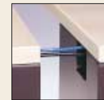
Narrow Support Legs with wire support pass through