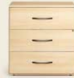
Steel Drawer Lateral Files (Optional)

All laminate filing cabinets have a safety mechanism that prevents two drawers from being opened at the same time. File drawers have fully progressive ball bearing suspensions and accommodate letter, legal and metric filing - side to side or front to back.