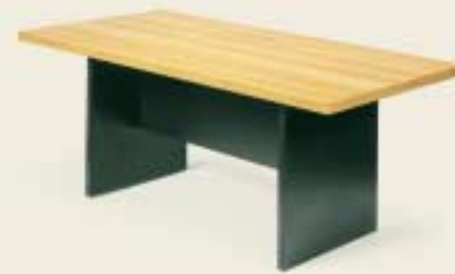
Panel Base - shown with a rectangular top

Round, square, rectangular and racetrack table tops can be supported by a variety of base designs.