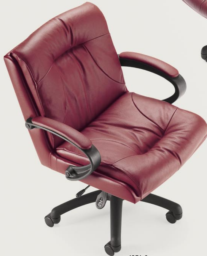
4371-2 Low Back Knee-Tilter

From executive suites to boardrooms and conference areas, Salerno provides comfortable and tasteful seating solutions.