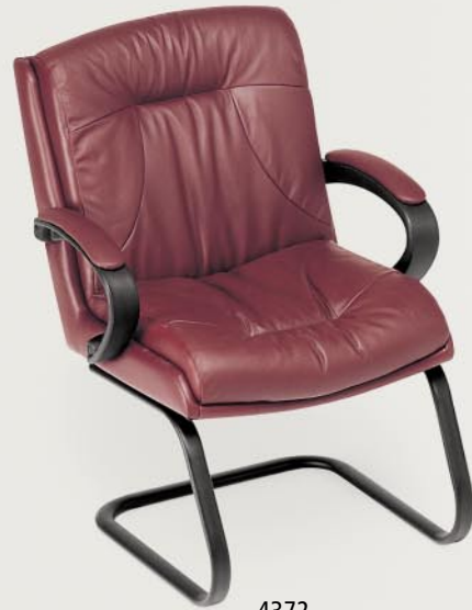
4372 Low Back Armchair