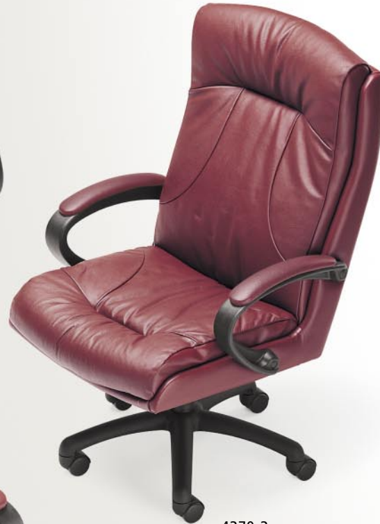
4370-3 High Back Multi-Tilter